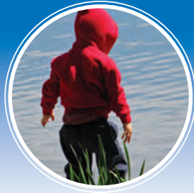
Sweatshirt* = 17 bottles