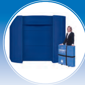
Exhibit/Display* = 80 bottles