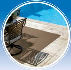
6' x 8' Indoor/Outdoor Carpet* = 48 bottles

*Bottle counts are approximate due to variation in size and thickness of bottles recycled and size of the finished product.