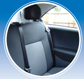
Back Seat of Car* = 90 bottles